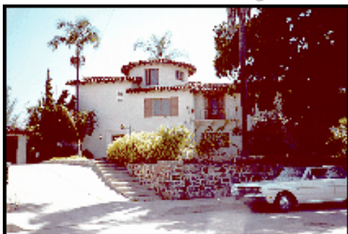
Beth Sarim, House of the Princes built in 1929 for Abraham and other princes

Many of the followers left the organization as a result of this action, they were later threatened by Rutherford to "suffer destruction" if they did not repent and recognize Jehovah's will as expressed through the Society.