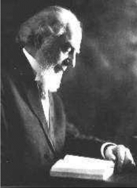
Charles Taze Russell, Founder of the International Bible Students Association, forerunner to the Jehovah Witnesses.

Most people have had a visit by Jehovah's Witnesses from the local Kingdom Hall. Reactions vary, from rudeness, to hospitality. Just who are these Witnesses? Are they Christian? Are they a cult? To find these answers we need to examine the facts.