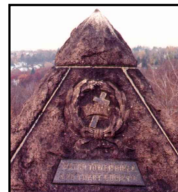
Pyramid at Russell's cemetery

"Therefore we may confidently expect that 1925 will mark the return of Abraham, Isaac, Jacob and the faithful prophets of old, particularly those named by the Apostle in Hebrews chapter eleven, to the condition of human perfection" ( Millions Now Living Will Never Die , pp. 89-90).